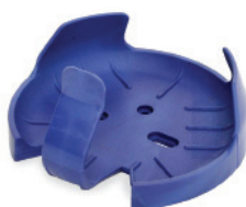
30400102 Flask Clamp PVC 1000 mL