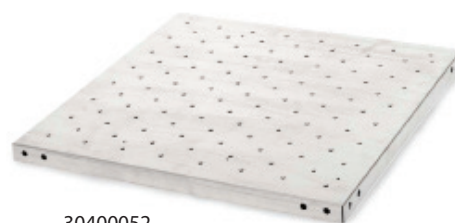
30400052 Universal Platform, 28 × 33 cm, S/S