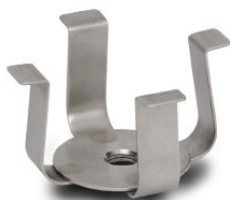
30400093 3 Liter Erlenmeyer Flask Clamp