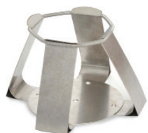
30400096 6 Liter Erlenmeyer Flask Clamp