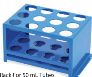
30400120 Test Tube Rack For 50 mL Tubes